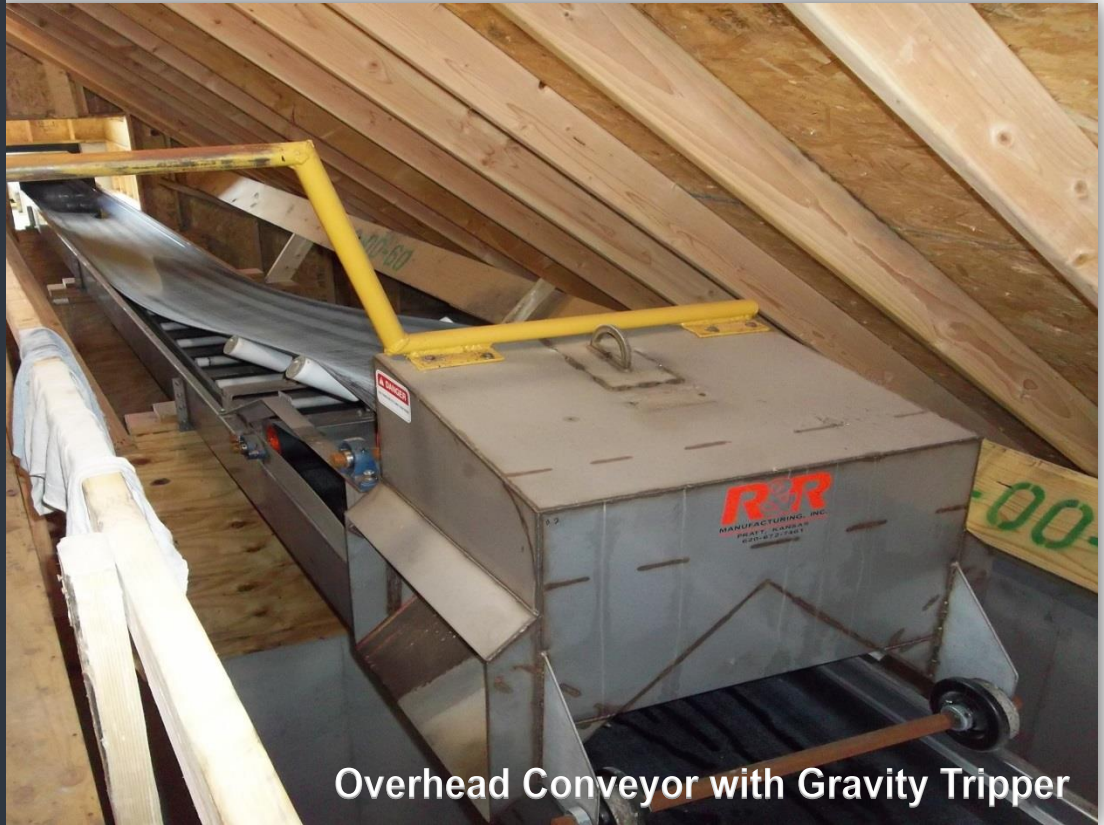
Overhead Conveyor with Gravity Tripper